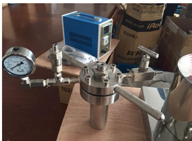
Ultrasonic material dispenser