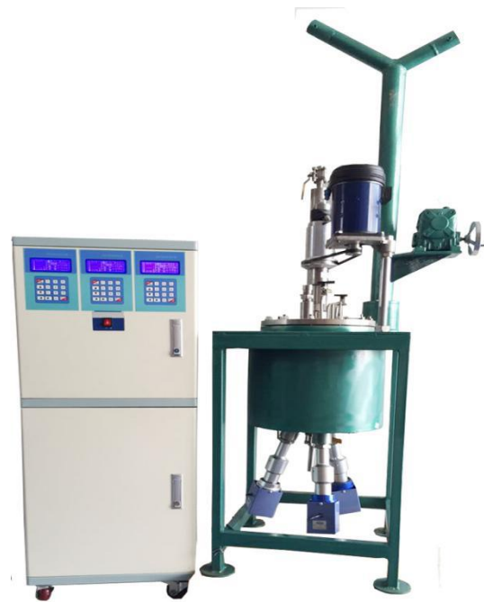
TUHP-10L industrial type