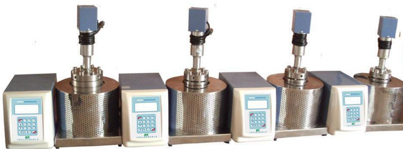
Ultrasonic cell crusher