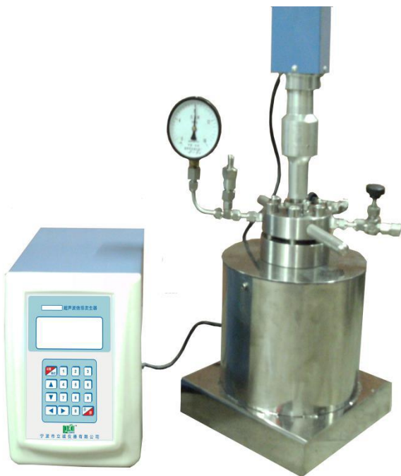
TUHP-500ml laboratory type

Ultrasonic reactor is consist of ultrasonic signal generator, stirring, constant temperature device, stainless steel pressure resistance reactor body, energy-gathered ultrasonic transducer and titanium alloy amplitude transformer. Ultrasonic transducer is fastened on reactor body through professional flange, ensure air pressure no leakage, reactor could customize double layer or three layers to heating or cooling, at the top of reactor could install dedicated magnetism-stress coupling adjustable-speed motor so as to guarantee there's no dead angle in reactor. Could customize material charging, discharging, reflux device, etc. Reactor lid could choose mechanical lifting device.