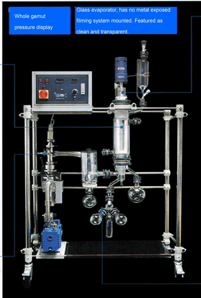
Glass evaporator, has no metal exposed filming system mounted. Featured as clean and transparent.