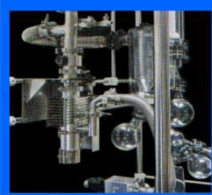
Diffusion pump set